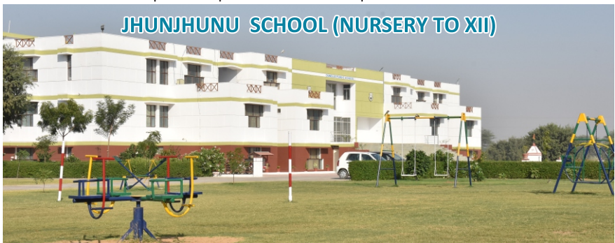
JHUNJHUNU SCHOOL (NURSERY TO XII)