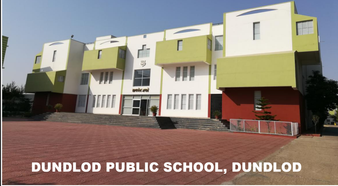
DUNDLOD PUBLIC SCHOOL, DUNDLOD

"Where Good Education Leads Goods Human Being Follows"