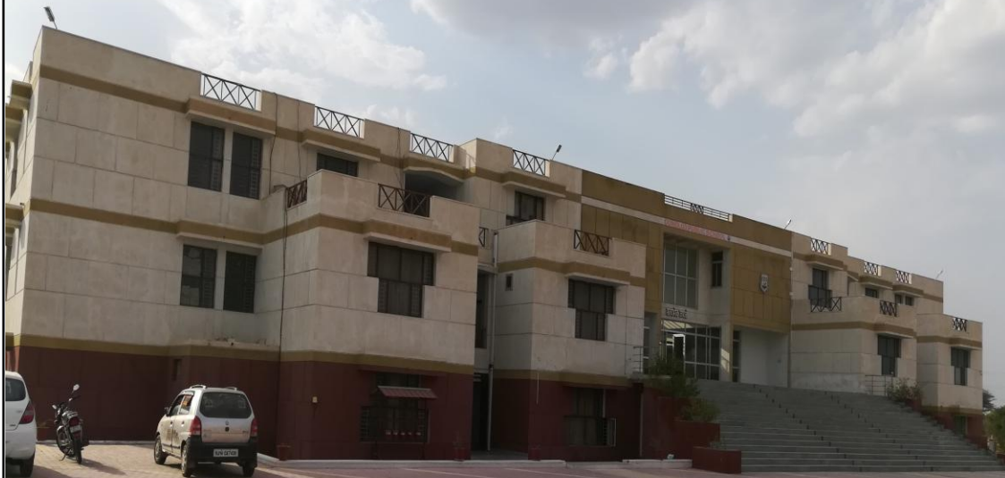
DUNDLOD PUBLIC SCHOOL, JHUNJHUNU