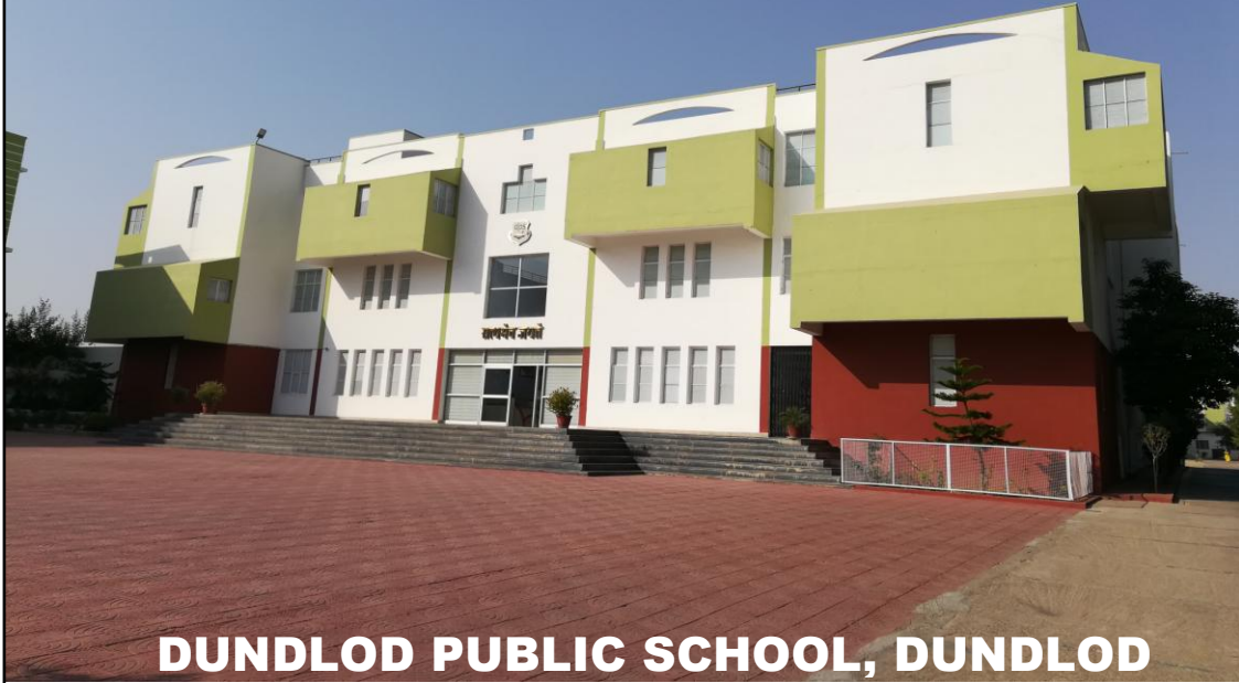
DUNDLOD PUBLIC SCHOOL, DUNDLOD