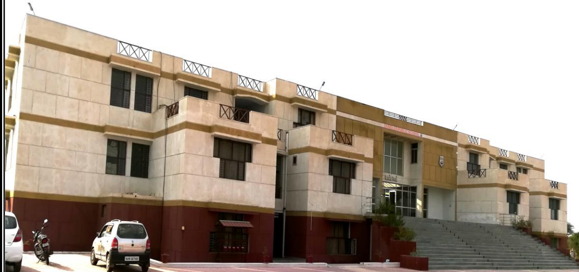
DUNDLOD PUBLIC SCHOOL, JHUNJHUNU