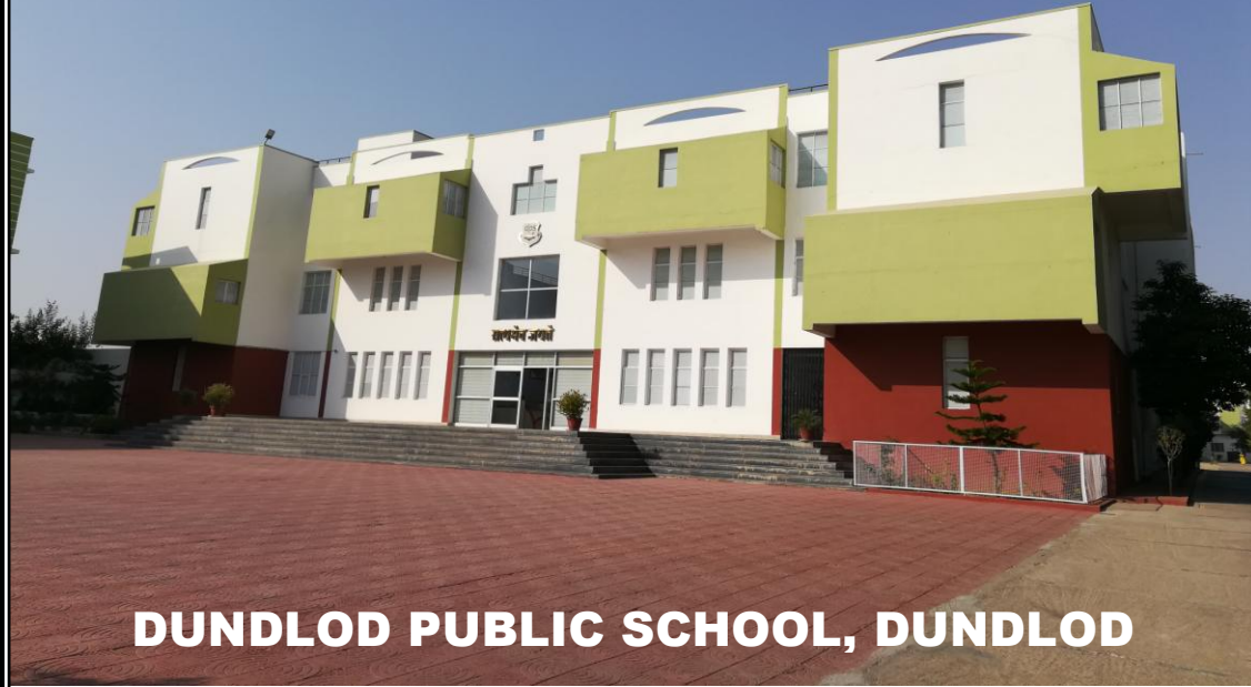
DUNDLOD PUBLIC SCHOOL, DUNDLOD