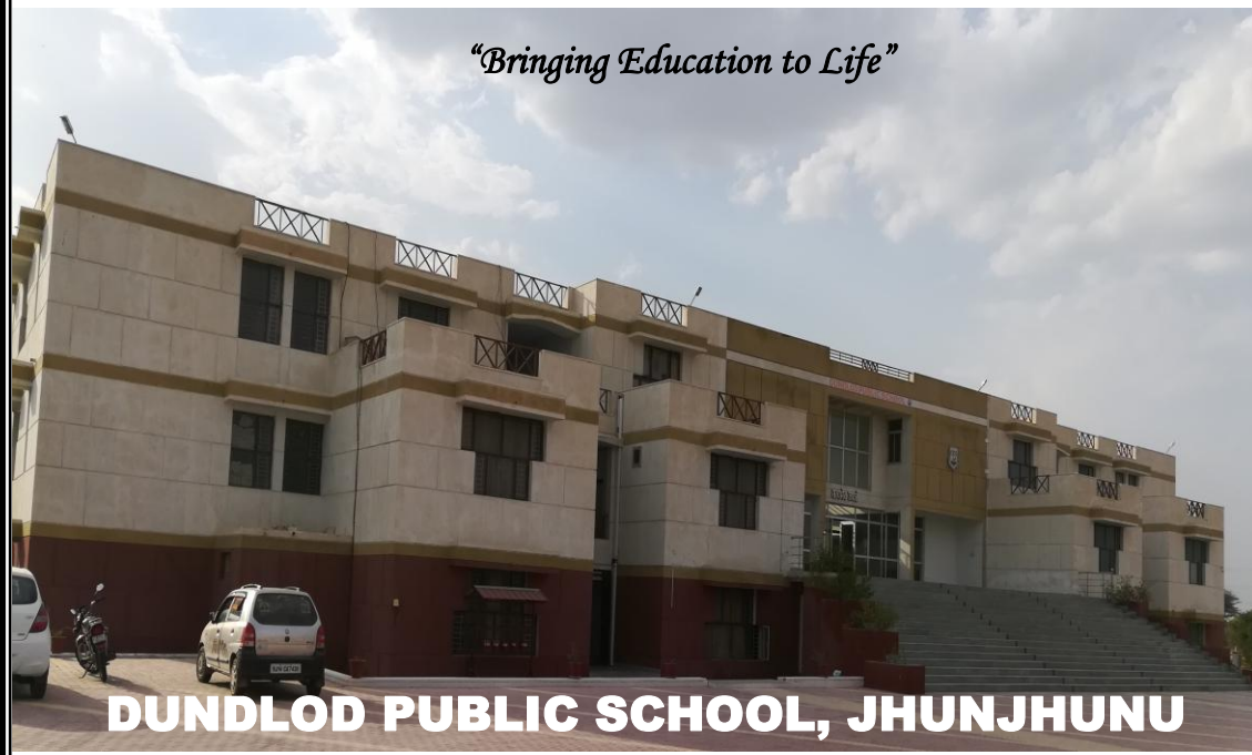
DUNDLOD PUBLIC SCHOOL, JHUNJHUNU