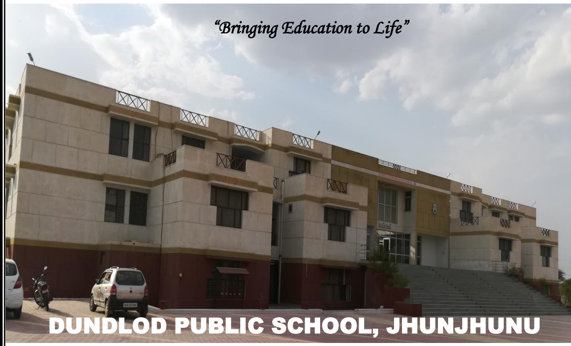
DUNDLOD PUBLIC SCHOOL, JHUNJHUNU