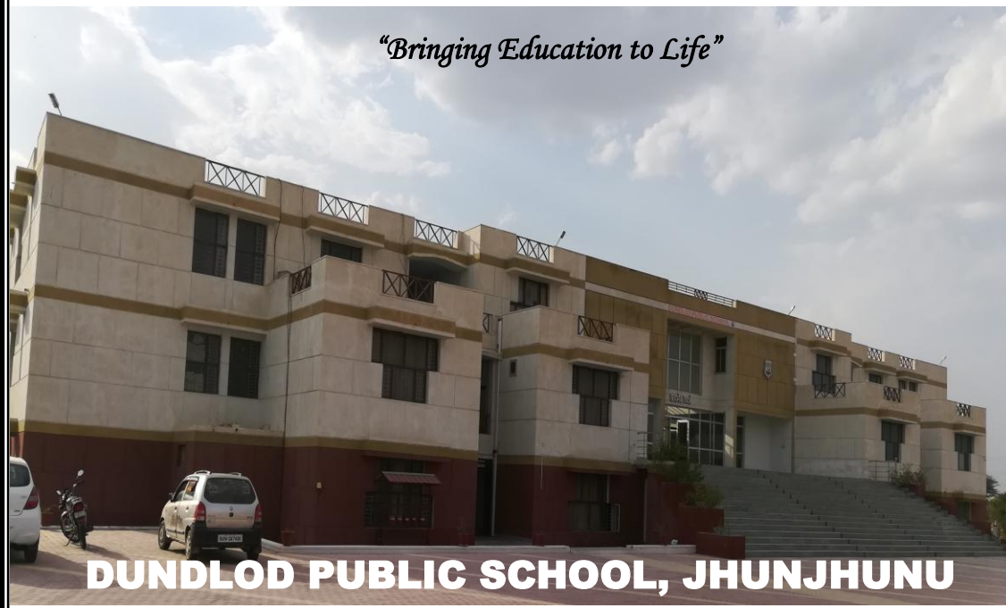
DUNDLOD PUBLIC SCHOOL, JHUNJHUNU