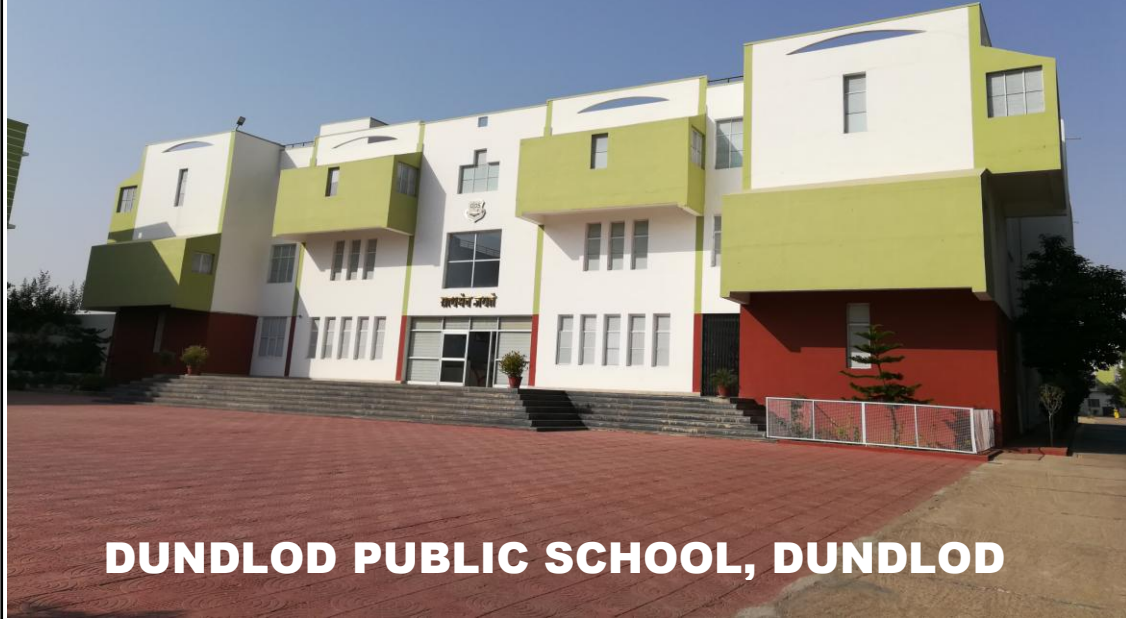
DUNDLOD PUBLIC SCHOOL, DUNDLOD