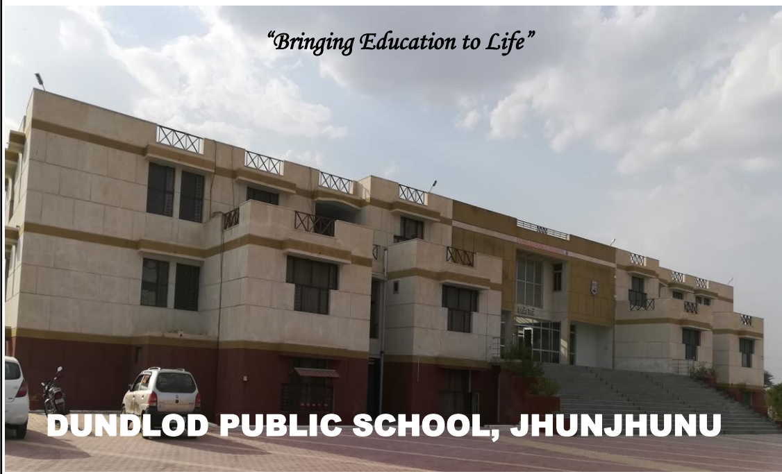
DUNDLOD PUBLIC SCHOOL, JHUNJHUNU