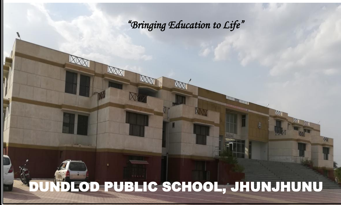
DUNDLOD PUBLIC SCHOOL, JHUNJHUNU